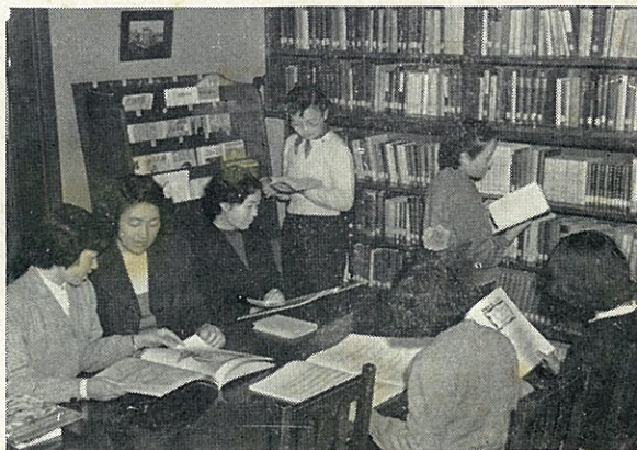
(5) THE BUSY LIBRARY OF A JAPANESE CHRISTIAN HIGH SCHOOL