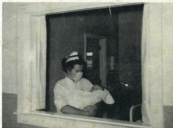
(9) THE PRIDE OF THE NURSERY!