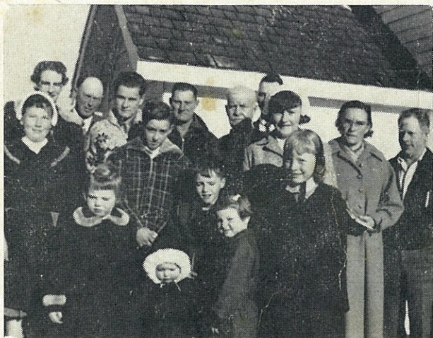
(4) THE CHURCH "FAMILY" WORSHIPS TOGETHER