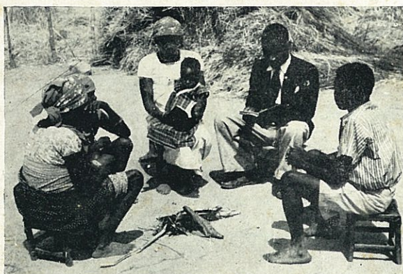
(8) AN AFRICAN FAMILY AT WORSHIP