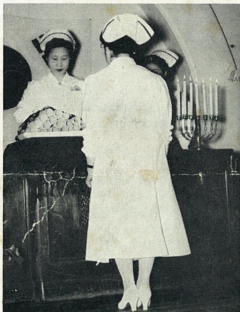
(6) A KOREAN SUPERINTENDENT OF NURSES AWARDS DIPLOMAS