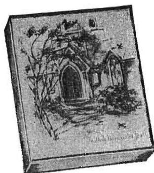
EASTER ASSORTMENT 14 beautiful Easter cards