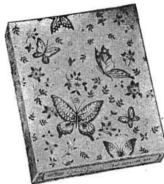
GOLDEN FAVOURITES Rich 14-card all-occasion assortment